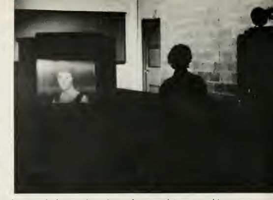
In semi-darkness, the RCA wide-spaced image orthicon TV camera tube picks up and displays clearly the image of a human model.

A second demonstration featured an RCA-developed wide-spaced image orthicon — described by Mr. Smith as basically a standard TV camera pickup tube with innovations increasing its sensitivity from five to ten times. Designed to provide television pictures with good resolution and clarity under low light conditions, the tube will televise objects in darkness equivalent to that of a cloudy, moonlit night. In the demonstration, a TV camera employing the tube was focused on a model seated in a lighted room. The camera was turned on and