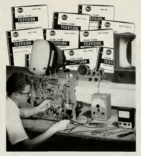
With the Institutes home study course in TV servicing, the student may acquire kit to build a set of his own.

Like so many RCA activities, the Institutes provides through these home study programs as well as its resident instruction a service to the electronics industry at large, by providing the finest instruction for men who are in or will enter the electronics industry, and by producing technicians with a solid grounding in theory and practice.