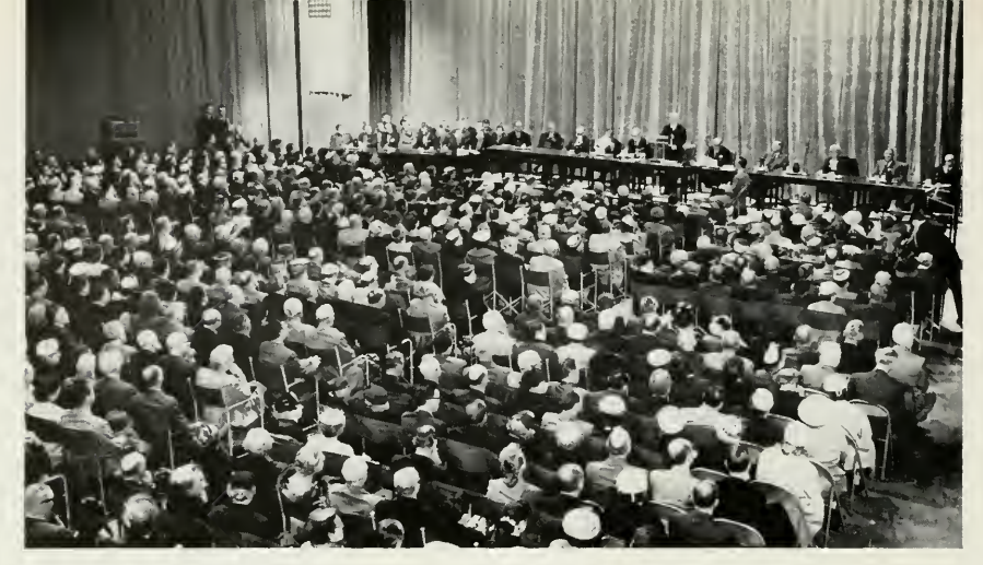
A general view of the 37th Annual Meeting of RCA Stockholders.