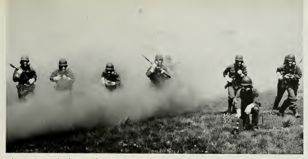
Advancing in a simulated gas attack at Maorestown, a detachment of soldiers dons mosks in response to o warning from the RCA-Chemical Corps nerve gas detector. The unit is shown on ground at right.

in an operating unit devoted exclusively to this mission. This is our Defense Electronic Products unit, and the organization here at Moorestown is a part of this unit."