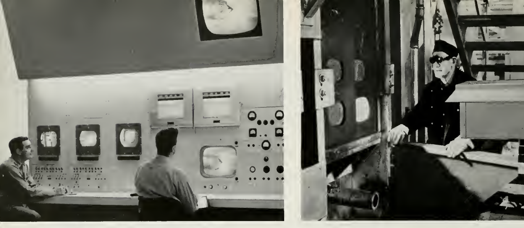
RCA Industrial TV watches wind-tunnel model tests . . .