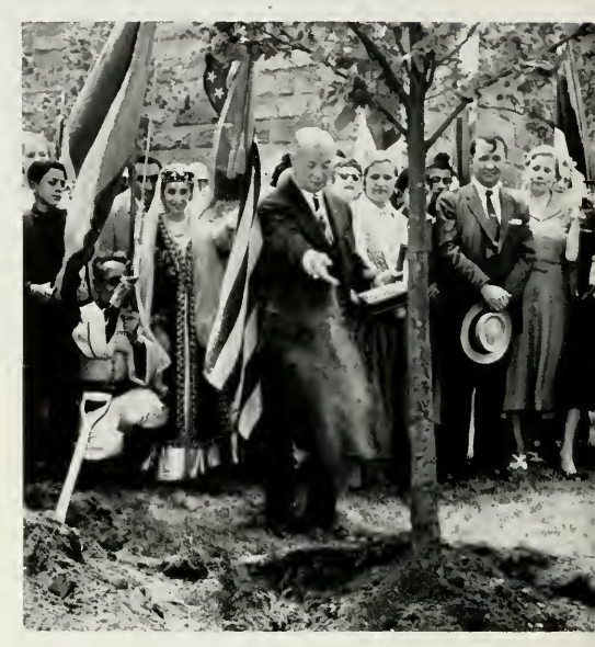
Earth from 48 states and 34 other free nations is sprinkled by General Sarnoff during tree-planting ceremony at foot of the Statue of Liberty on National Unity Day, June 28. In background are representatives of same of the 37 nationality groups participating.

Let me say a few words about that adjustment, which millions of new Americans — your forebears — have had to make. It is a bewildering experience to be transported, by a mere ocean journey, from the Middle Ages to the Twentieth Century; from a fixed and frozen background to this infinitely dynamic America; from the past, one might say, straight into the future.