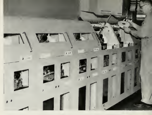
This new terminal equipment links RCA TEX with Bell System TWX network throughout the U. S.

RCA Communications' international TEX service passed another milestone in April when its facilities were made available to the 38,000 customers of the Bell System TWX network throughout the United States. By giving intercontinental range to their office teletypewriters, TEX service now enables these businessmen to talk-in-writing with their correspondents in Frankfurt, Germany, as easily as they might contact an associate in Frankfort, Kentucky.