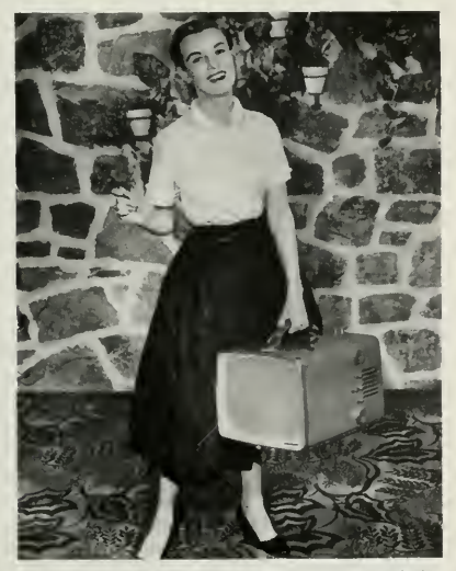
For portability, RCA Victor has introduced the "Wayfarer," with 108 square inches of picture area.

Besides the full range of service contracts, Mr. Cahill disclosed details of a newly developed remote control unit for color receivers. This will perform all control functions—channel change, adjustment of color hues, and sound—and will be available through local RCA Victor dealers. Nationally advertised list price of the unit, including installation, is $89.95.