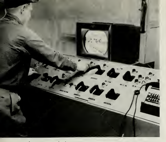
observes steel plates on a conveyer . . .