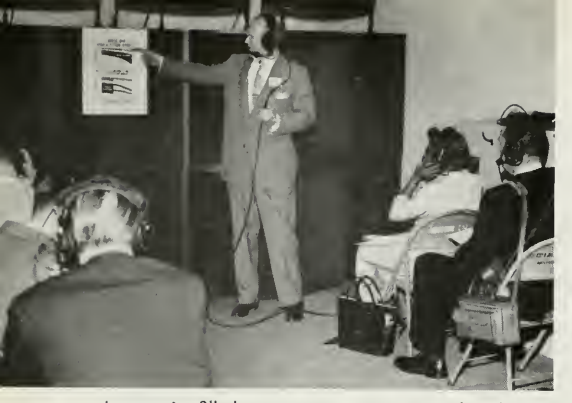
In a noise-filled room, reporters equipped with RCA noise-cancelling microphones and headsets test effectiveness of the equipment.

"nerve" gas, or G-agents, in the air. A highly classified development until several months ago, the unit has been accepted by the Chemical Corps as a field alarm. It weighs only 24 pounds, measuring 15 inches high, 17 inches wide, and 7 inches deep.