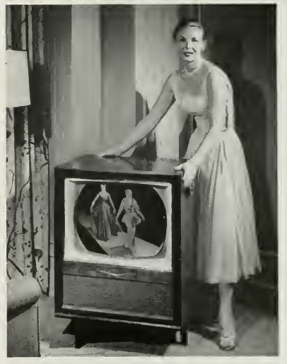
A star performer in black-and-white TV is the new RCA Victor "Enfield" swivel console receiver shown here.