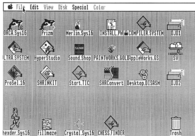
Figure 2. Gridlocked desktop

"categorical" directories contains several directories with individual programs; "Dev" contains folders for "Merlin16P" (Merlin 16 Plus), "Orca" (ORCA/M and tools), "APW" (Apple Programmer's Workshop and tools), "AS" (Applesoft), and so on. Most of my actual executable programs are therefore about two directory levels deep. If you have fewer programs, you may wish to keep them only one subdirectory level deep (that is, you might prefer to have an "AS" folder in the root directory and skip the "Dev" folder).