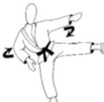
back spin kick