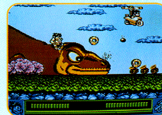
The most advanced arsenal of stone-age weaponry!