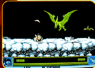
One- or two-player pterodactyl-diving, dinosaur-bashing action!

That bogus bunch of Neanderthal nerds must have kidnapped the cavewomen and eaten the food! With no time to lose, Joe must single-handedly rescue the beloved cavewomen...and find some dinner along the way!