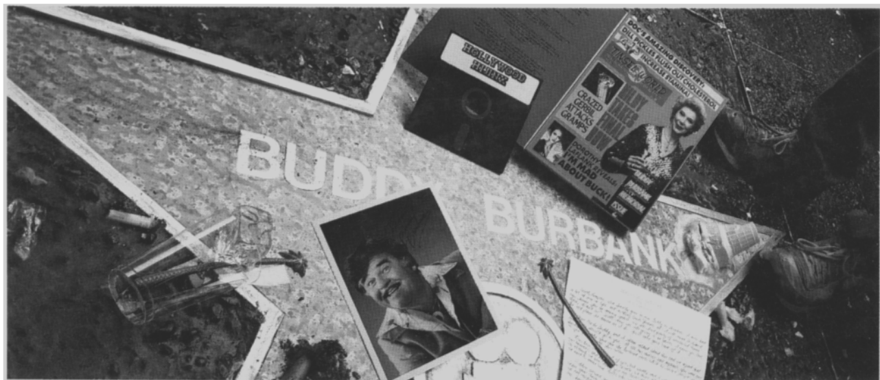
Featured in every package of HOLLYWOOD HIJINX: your HOLLYWOOD HIJINX disk; a star-studded copy of TINSELWORLD magazine; your Aunt Hildegard's will; an autographed photo of your Uncle Buddy; and a lucky palm tree swizzle stick.

Vampire Penguins. A Corpse Line. Meltdown on Elm Street. Who could forget these classic Hollywood movies produced by your uncle, Buddy Burbank? But his greatest masterpiece has yet to be experienced... HOLLYWOOD HIJINX, starring you!